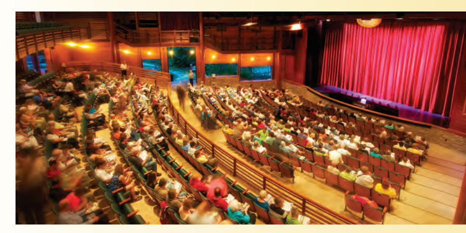
Performances are held rain or shine in the all-weather pavilion. Performances 6 nights a week. No shows on Mondays.

- Patron Comments, Grueninger Travel Group