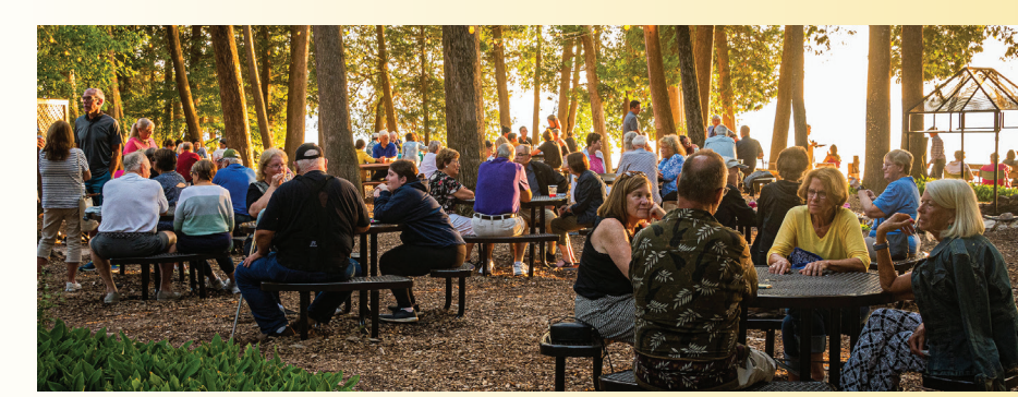
Performances are held rain or shine in the all-weather pavilion. Performances 6 nights a week. No shows on Mondays.

- Patron Comments, Grueninger Travel Group